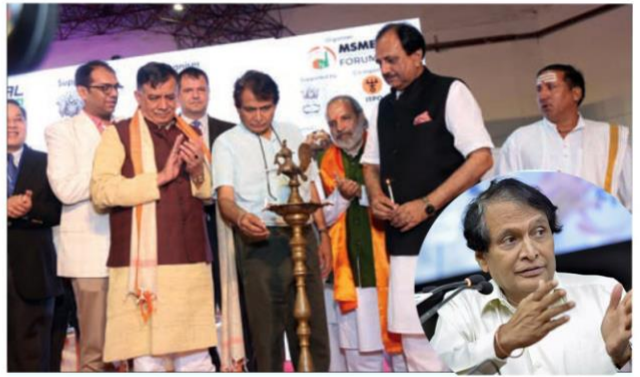
Sh. Suresh Prabhu, Union Minister of Railways, Commerce & Industry with Sh. Satish Mahana, Industry Minister, UP & Sh. Jai Bhagwan Goel Inaugurating 5th Expo