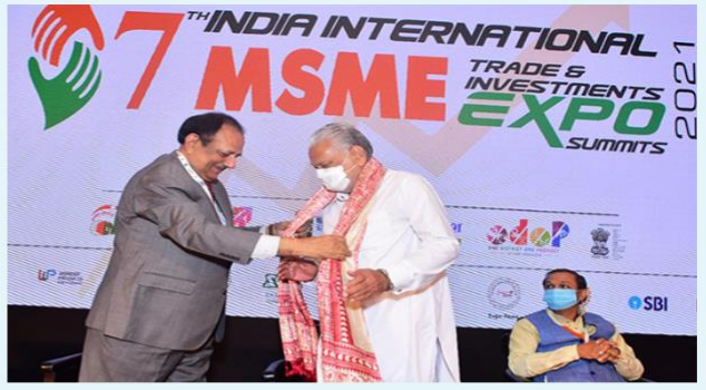
Shri Parshottam Rupala, Minister of Fisheries, Animal Husbandry and Dairying