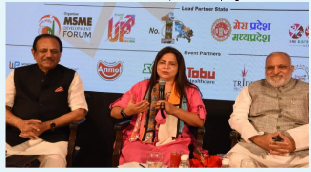
Smt. Meenakshi Lekhi, Minister of State for External Affairs and Culture