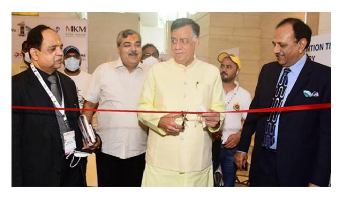
Sh. Satish Mahana, Industry Minister, U.P.